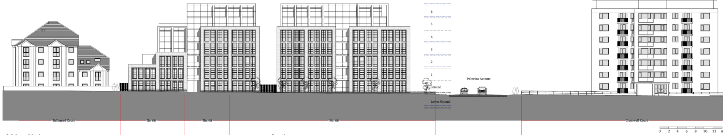
02 Cromwell Road Context