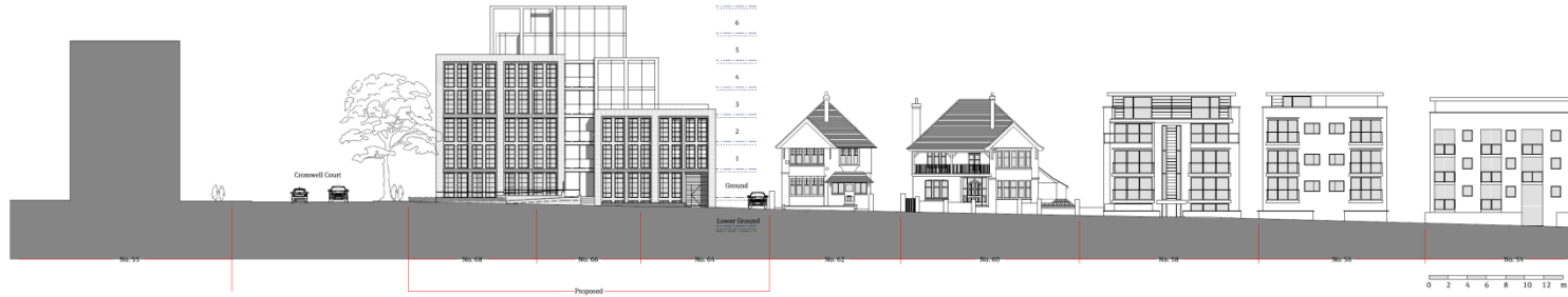
01 Palmira Avenue Context